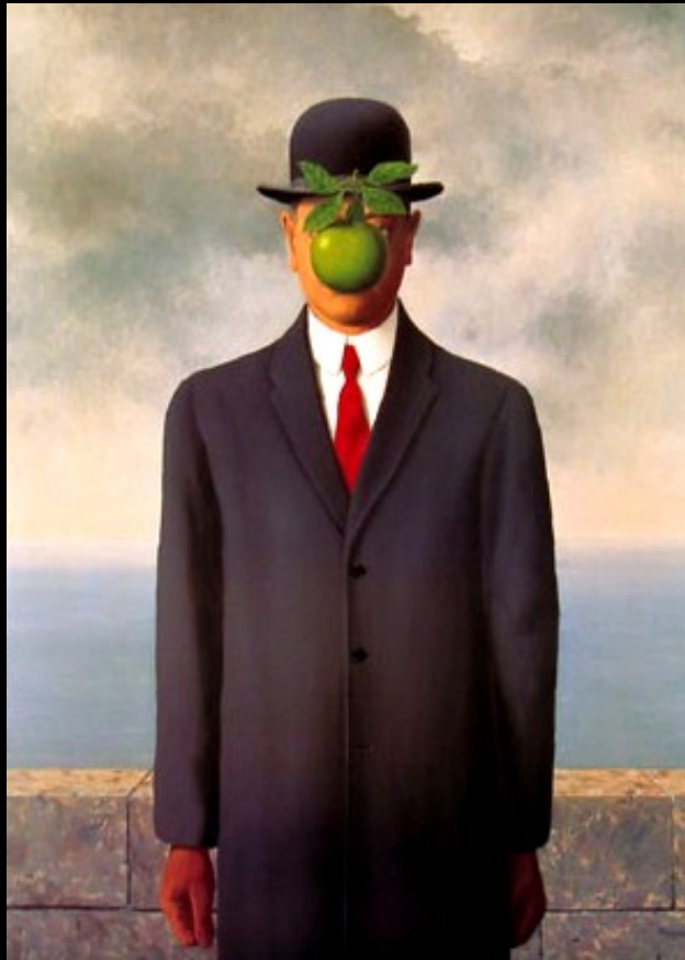
“The Son of Man” 1964